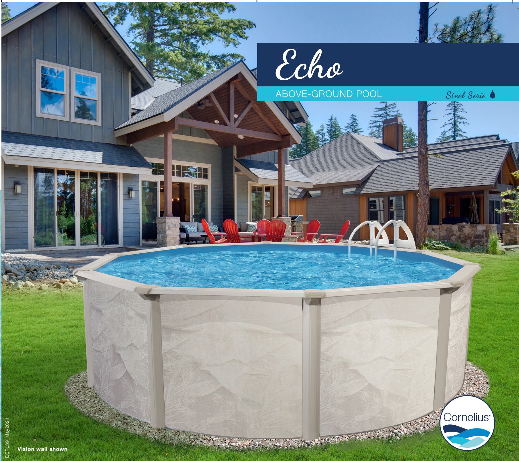
Vision wall shown