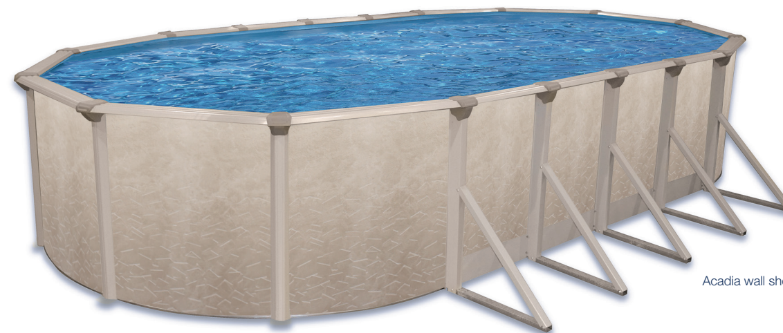
Acadia wall shown