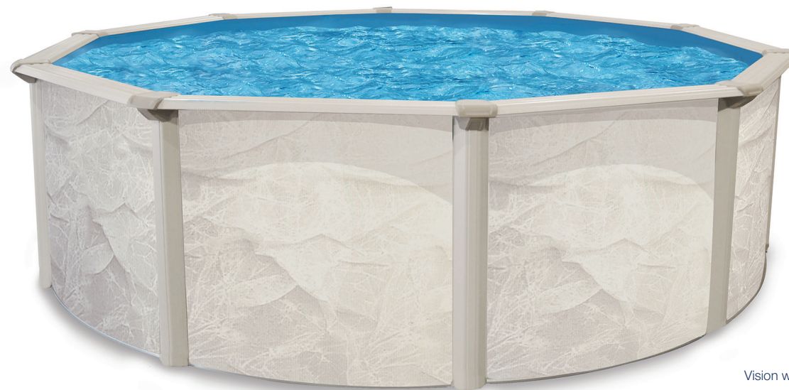
Vision wall shown