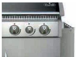
Folding Side Shelf