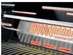
Rear Infrared Rotisserie Burner