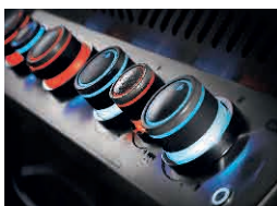
Night Light Knobs with Safetyglow