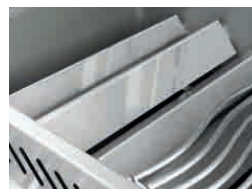
Dual-Level, Stainless Steel Sear Plates