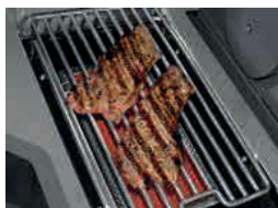
Infrared SIZZLE ZONE® Side Burner with stainless steel griddle