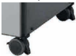
Easy roll Locking Caster