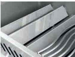
Dual-Level, Stainless Steel Sear Plates