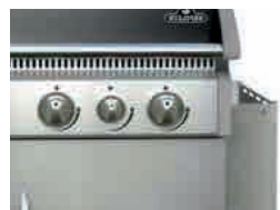
Folding Side Shelf