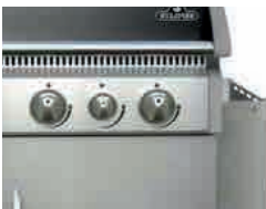
Folding Side Shelf