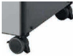
Easy roll Locking Caster